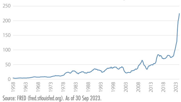
Exhibit 3: US Private Investment in Manufacturing ($bn)

Given the strength of the US economy, the focus on interest rate cuts within the investment and business communities is perplexing. Inflation has moderated—albeit to levels much higher than the past decade—and the economy is humming. Why do rates need to come down with the economy so strong? In weaker economies such as Europe and the UK, on the other hand, it makes sense that interest rates should fall; their economies are anemic, inflation has cooled and stimulus is arguably needed. And with weak European economies and likely steep interest rate cuts relative to the US, we don't see the dollar weakening any time soon.